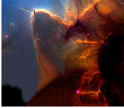
Figure 4: A view the Trifid Nebula, one of the numerous dark nebulas existing in the universe. They are generally interpreted as being due to dense aggregates of matter, thus being opaque to light. Recent studies have indicated the possibility that at least some of the nebulas are caused by antimatter because of their being totally opaque to matter light. In the event confirmed, the latter feature would support the entire content of this note, because it would establish our inability to see antimatter with ordinary light as well as establish the absorption without refraction of matter light originating from clear matter stars in their background.

levels, as well as admitting new predictions [2].