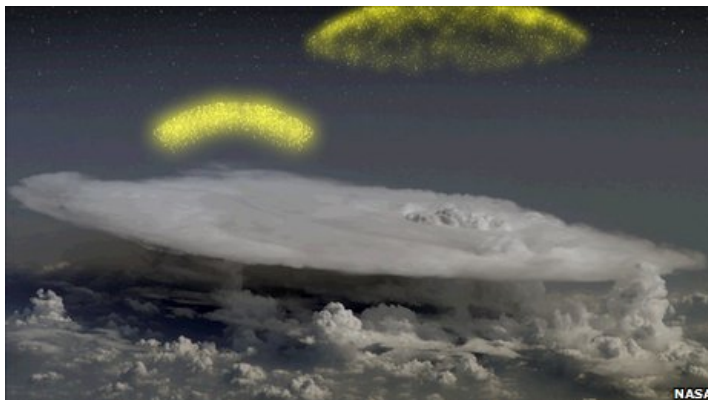
Figure 3: Picture recently released by FERMILAB illustrating the apparent existence of antimatter in the universe.

Even though charge and isodual conjugations are both anti-Hermitean, their differences are not trivial. From a physical viewpoint, charge conjugation conjugates states in a Hilbert space, but does not conjugate the local coordinates x . This implies that, for 20th century theories, antimatter exists in the same spacetime of matter. At any rate, the relegation of antimatter at the level of second quantization, e.g., via Dirac’s “hole theory,” leaves the Minkowski spacetime unique, thus entirely characterized by the fundamental Poincaré symmetry and special relativity.