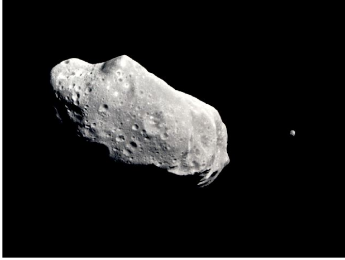
Figure 1: An illustration of the main objective of this note: can we identify antimatter asteroids with Sun light or to protect our planet we need a new technology? This problem will also be studied at a workshop in Italy, September 5-9, 2011, http://www.workshops-hadronic-mechanics.org/

\psi(x) over the field of complex numbers \mathcal{C} and can be characterized by expressions of the type