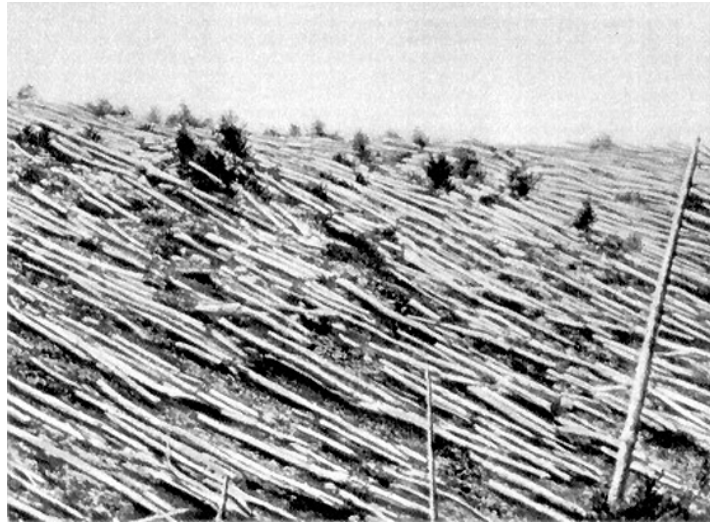
Figure 2: A view of the devastation caused by the 1908 Tunguska explosion in Siberia that has been estimated as being the equivalent of 1,000 atomic bombs, yet it left no crater or solid residue in the ground. Consequently, the Tunguska explosion is solely representable on a quantitative-numerical way via an antimatter asteroid annihilating in our atmosphere. Other interpretations have been dismissed by calculations because essentially conceptual. For instance, the hypothesis of a comet has been disproved on various quantitative grounds, such as: absence of a necessary depression in the ground caused by the expected huge amount of water; basically insufficient energy to represent the event; inability to represent the luminescence of the entire atmosphere on Earth for days, which luminosity is solely representable via radiations typical of annihilation processes; and other reasons. There is additional evidence of antimatter asteroids hitting our planet, such as large explosions in the upper atmosphere that are known not to be caused by atomic bombs. Additionally astronauts and cosmonauts routinely see “flashes” in the upper atmosphere when in darkness that can solely be interpreted as due to the annihilation of antimatter cosmic rays.