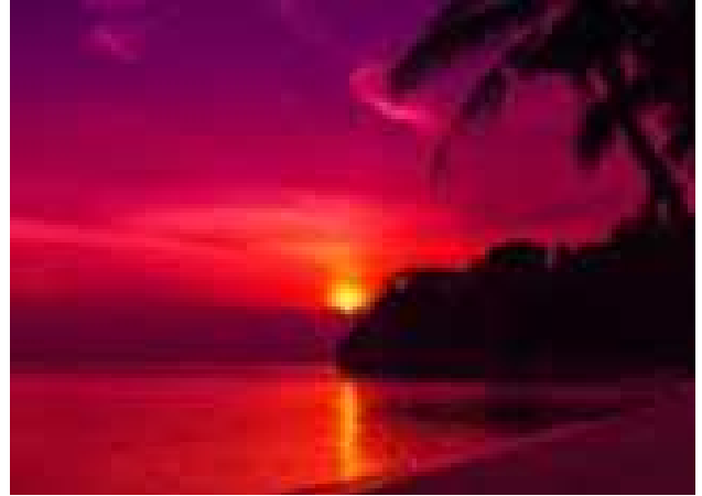
Figure 1. According to the first and perhaps most important unresolved historical criticism of Einstein gravitation, Sunset is a visual evidence of the lack of actual, physical, curvature of space because we still see the Sun at the horizon, while in reality it is already below the horizon due to the refraction of light passing through our atmosphere. Exactly the same refraction without curvature of space occurs for star-light passing through the Sun chromosphere, in which case the only "bending of light" is that due to Newton's gravitation in a flat space (see Section 2). Note that Einstein gravitation cannot represent light refraction because it requires a locally varying speed of light within a medium, first with increasing and then decreasing density. Hence, the representation of refraction via the curvature of space violates visual evidence, physical laws and experimental data [111-15]. To achieve a credible proof that the bending of Star-light passing near the Sun is "evidence" of the curvature of space, Einstein supporters have to prove that star-light passing through the Sun chromosphere does not experience refraction. The impossible existence of such a proof is readily seen from the fact that Einstein gravitation was solely aimed at a description of "exterior gravitational problems in vacuum," while the propagation of star-light within the Sun chromosphere is strictly an "interior gravitational problem" treated later on in Section 5. Its description via the Riemannian geometry is beyond any realistic possibilities due to the need for a metric possessing a dependence on coordinates x , as well as density \mu , temperature \tau , frequency \omega , etc. g = g(x, \mu, \tau, \omega, \dots) (see Sections 5-11 below).

of bodies in a gravitational field, and other basic events that are clearly represented by Newton gravitation.