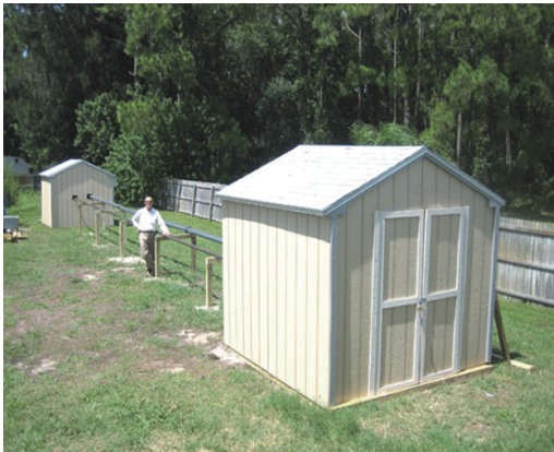
FIGURE 1. A view of the IsoShift Testing Station built by Santilli and his technicians in early 2009.

Almost after two consequent decades of refusals Santilli decided to conduct the needed experimental measurements since he had no other choice to demonstrate these fundamental implications. Consequently, with the assistance of the technicians at the Institute for Basic Research in Florida, as well as the support of external laser experts, Santilli constructed the IsoShift Testing Station consisting an initial air-conditioned cabin containing a blue laser; a second air-conditioned cabin containing wavelength analyzers; the laser and analyzer being interconnected by a 60 ft \approx 18 m long steel pressure pipe containing air at the maximal pressures up to 2000 psi \approx 137 bars. After several months of successful measurements, Santilli released the results for publication [12] and put the accent on the main scope of the measurements which was establish to confirm the existence of the IRS, without any possibility of conducting statistical averages with the available experimental set up